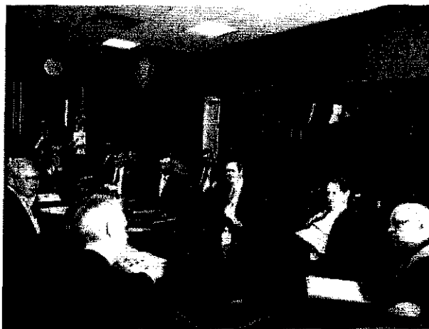
Senators Wyden and Merkley meet with Oregon commissioners and judges

March 1st turned out to be a pretty nice day in Washington, D.C. Blue skies, a light wind, temperatures in the mid 60's. The climate inside the House and Senate Office Buildings was nearly as pleasant, thanks to our Oregon Congressional delegation. Eighteen Oregon county commissioners and judges trekked the marble halls for meetings with Congressmen Walden, DeFazio and Schrader, Congresswoman Bonamici and both U.S. Senators.