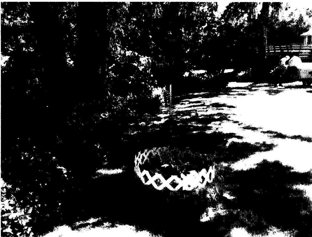
Location of septic tank (shovel as marker) and current backyard apparently contained in lot#899.