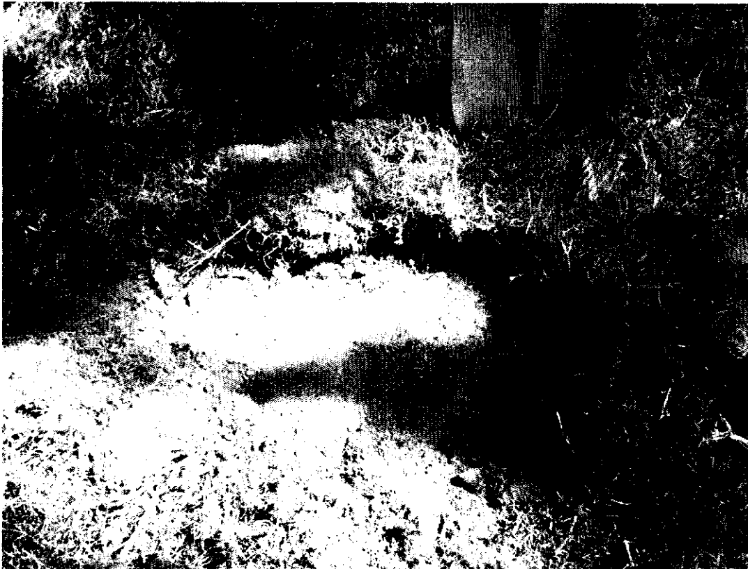
Concrete cap of old septic tank still buried in the Peery backyard as of 07-10-14.