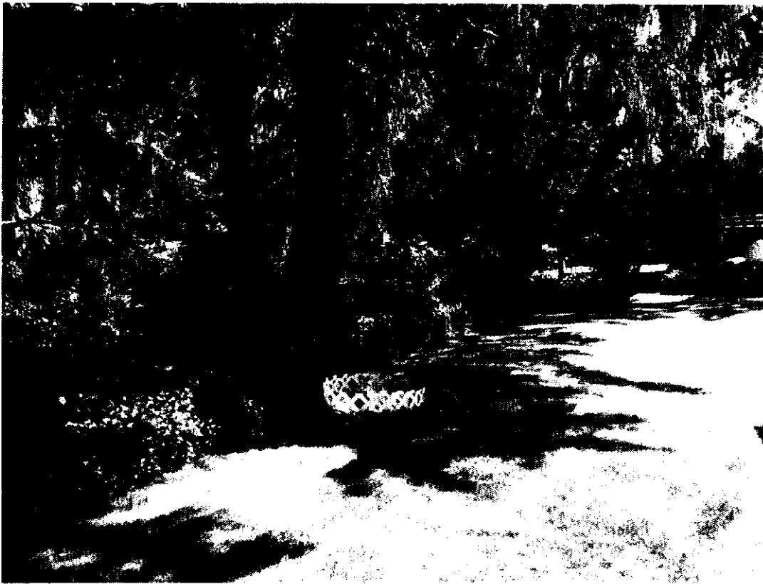
Contrast of same backyard location - current and then from the mid 1970s. This is my late father and my nephew pruning the Sitka Spruce tree located within #899. The same yard is shown to be maintained in both time periods.