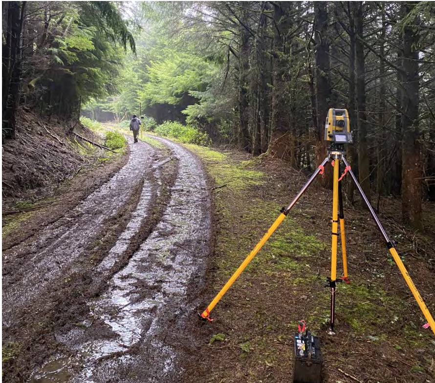
Total station set up for surveying