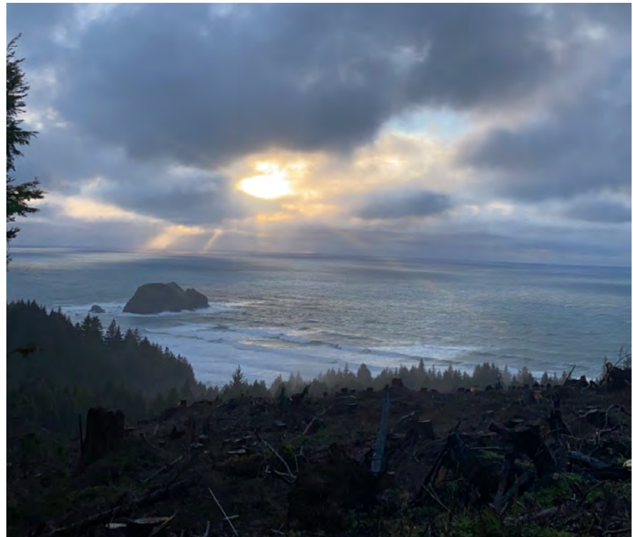
The view from the South side of the project.

https://highways.dot.gov/federal-lands/projects/or/tillamook-b780-1