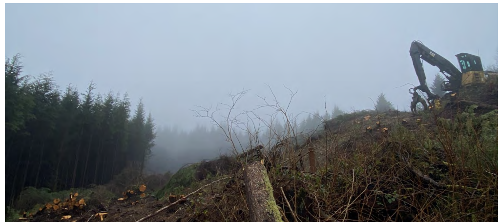
Timber processed on south side of the project.

https://highways.dot.gov/federal-lands/projects/or/tillamook-b780-1