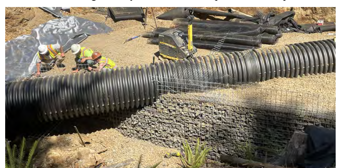
View of MSE Wall No. 1 with culvert after four completed courses.

Current road closure points will remain in effect on Bayocean Road near the Cape Meares Lighthouse, and approximately 0.5 miles south of the Lighthouse. Construction will have minimal impact on public traffic as it is closed to through traffic. Please be advised that project limits are now designated by barricades on Cape Meares Loop