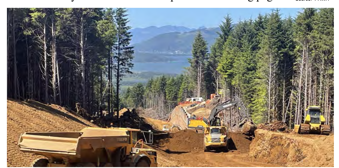
View of roadway excavation showing soldier pile in the background.

Current road closure points will remain in effect on Bayocean Road near the Cape Meares Lighthouse, and approximately 0.5 miles south of the Lighthouse. Construction will have minimal impact on public traffic as it is closed to through traffic. Please be advised that project limits are now designated by barricades on Cape Meares Loop coming south from Bayocean Road. See map on the following page.