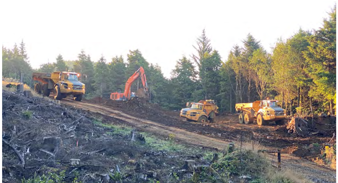
Excavation at st389.

Project Website: https://highways.dot.gov/federal-lands/projects/or/tillamook-b780-1