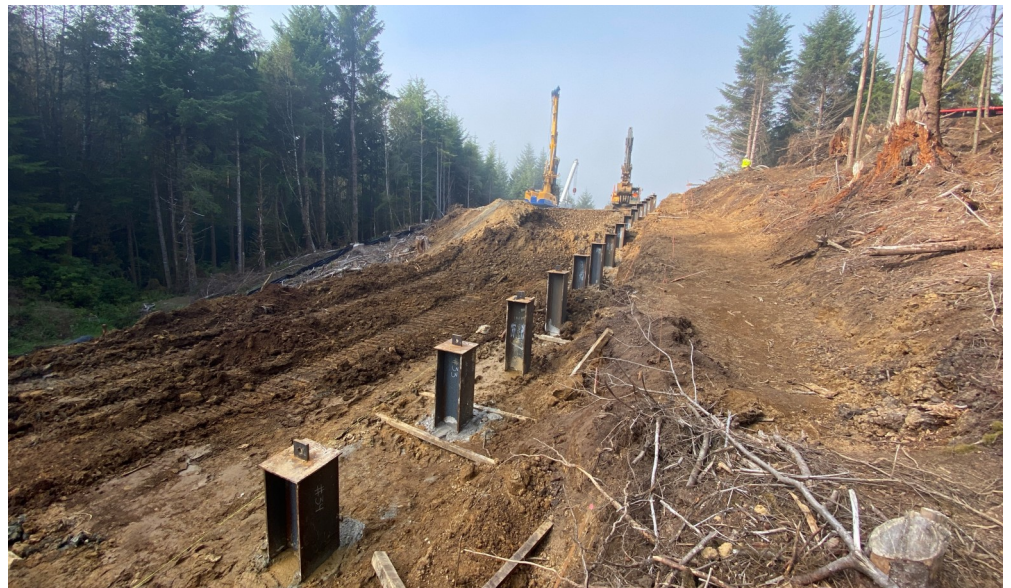
Soldier pile wall progress

https://highways.dot.gov/federal-lands/projects/or/tillamook-b780-1