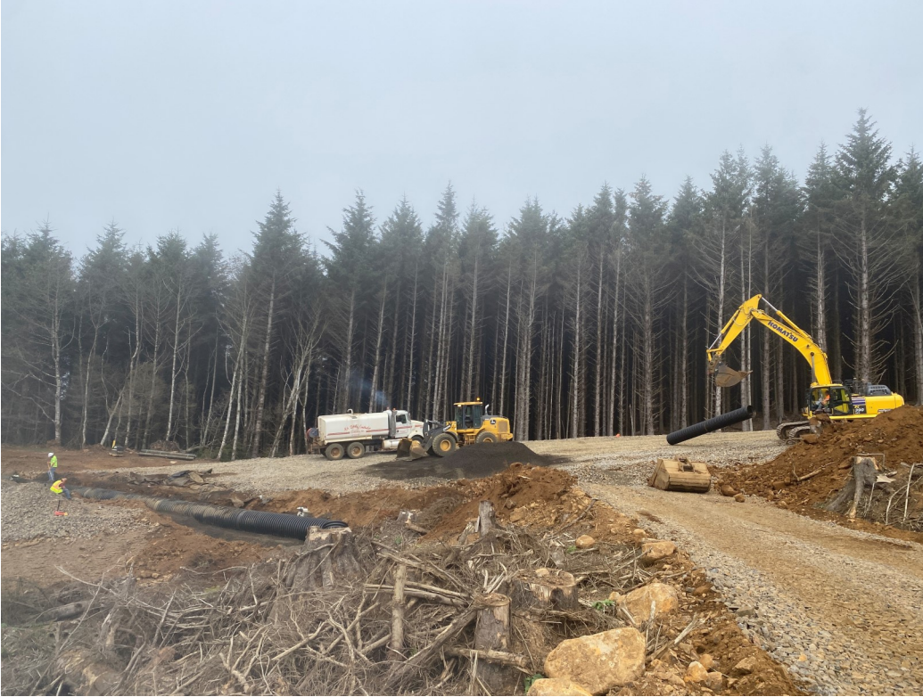
Installing culverts to ensure proper roadway drainage