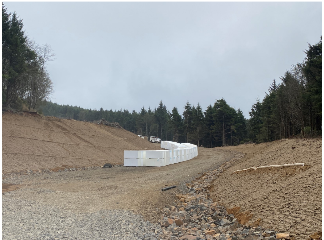
Geofoam fill material for the first row of the Geofoam Wall