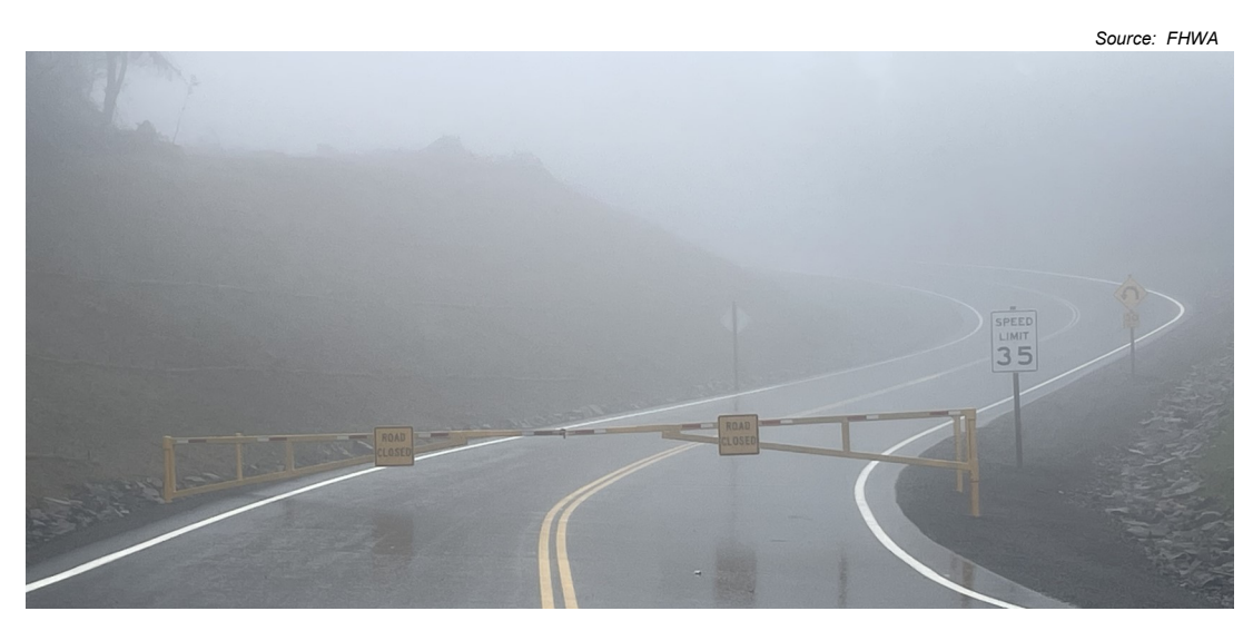
View of south entrance of the new Cape Meares Loop.

Current road closure points will remain in effect on Bayocean Road near the Cape Meares Lighthouse, and approximately 0.5 miles south of the Lighthouse. Construction will have minimal impact on public traffic as it is closed to through traffic. Please be advised that project limits are now designated by barricades on Cape Meares Loop. coming south from Bayocean Road. See map on the following page for areas not accessible to the public.