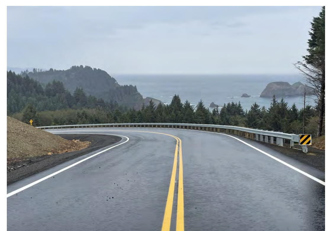
View of south side of the new Cape Meares Loop.

There may be future closure periods this winter during inclement weather, and during dry weather in 2024 to facilitate other planned work. Tillamook County will maintain road status on their website, or call their Public Works their Public Work Desk at 503-842-3419.