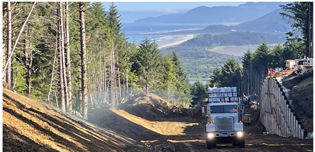
View of seed and mulch placement on embankment slopes.