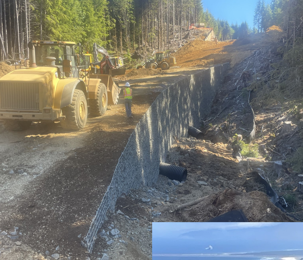
View of MSE wall construction progress after 18 courses with soldier pile wall in background.