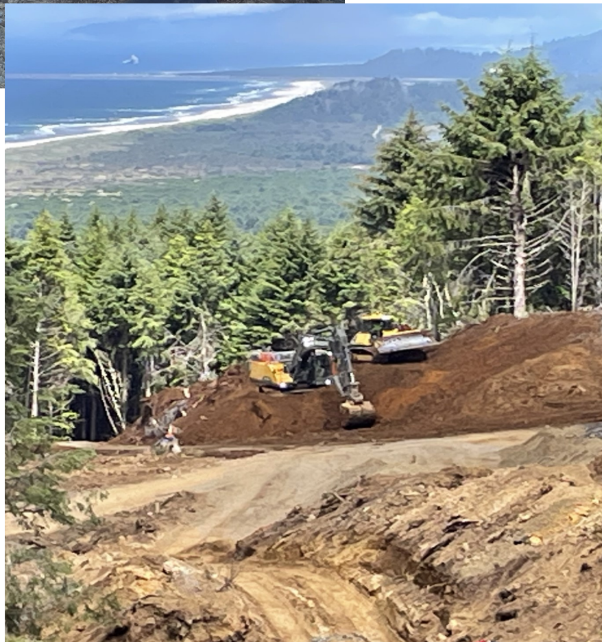
View of roadway excavation near the project limits nearest to Bayocean Road.